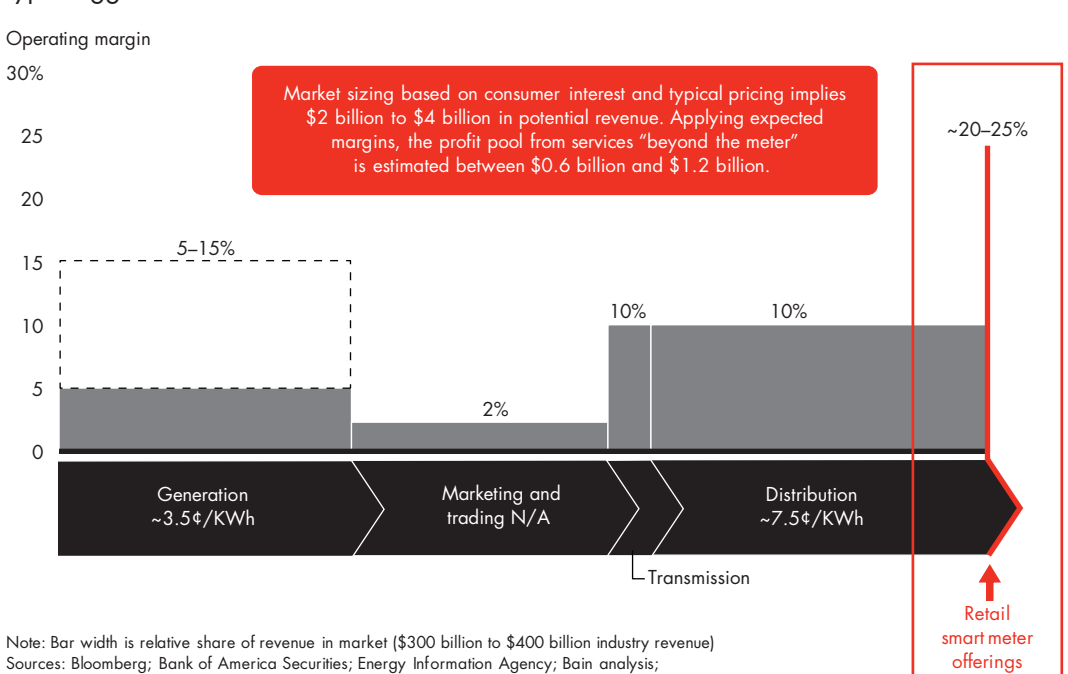
Figure 1: The market size for smart meter-enabled services is much smaller than the hype suggests

Revenues from beyond-the-meter services: Finally, we focused on four specific potential "beyond the meter" business opportunities: demand management, data/information, services and market making. We then projected the size of each of these businesses (the estimated number of customers in 2014 times the value per customer). That projects a market in the range of $1.7 billion to $4.2 billion, based on varying demand for each service.