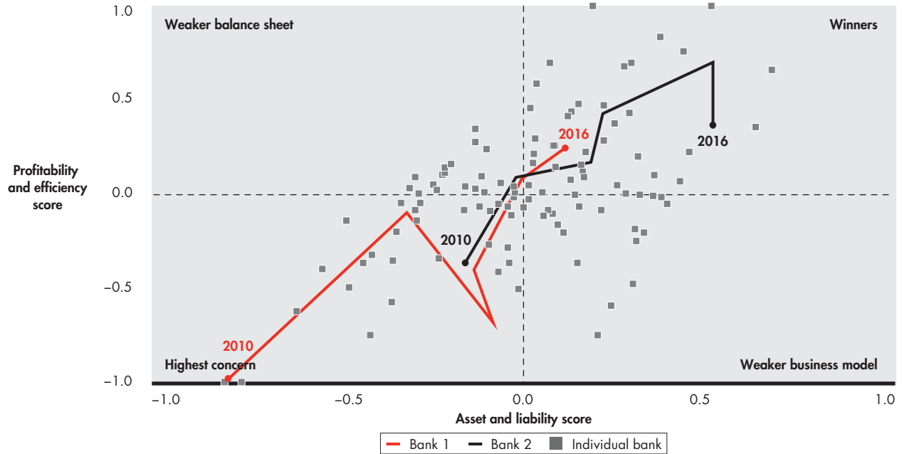
Figure 3: Two banks blazed a path back to health over six years

Sources: SNL Financial; banks' 2010–2016 annual reports; World Bank; Trading Economics; Bain analysis