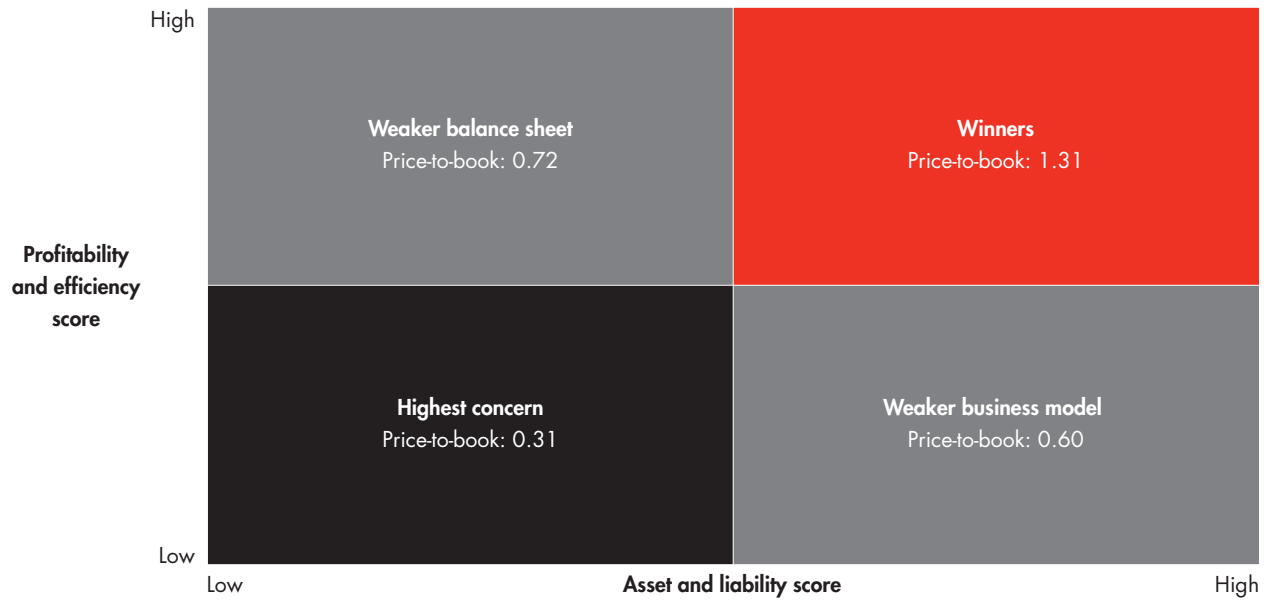
Figure 1: The group of winners get a huge multiple advantage from equity investors

Note: Price-to-book ratios for institutions that are publicly traded Sources: SNL Financial; banks' 2016 annual reports; World Bank; Trading Economics; Bain analysis